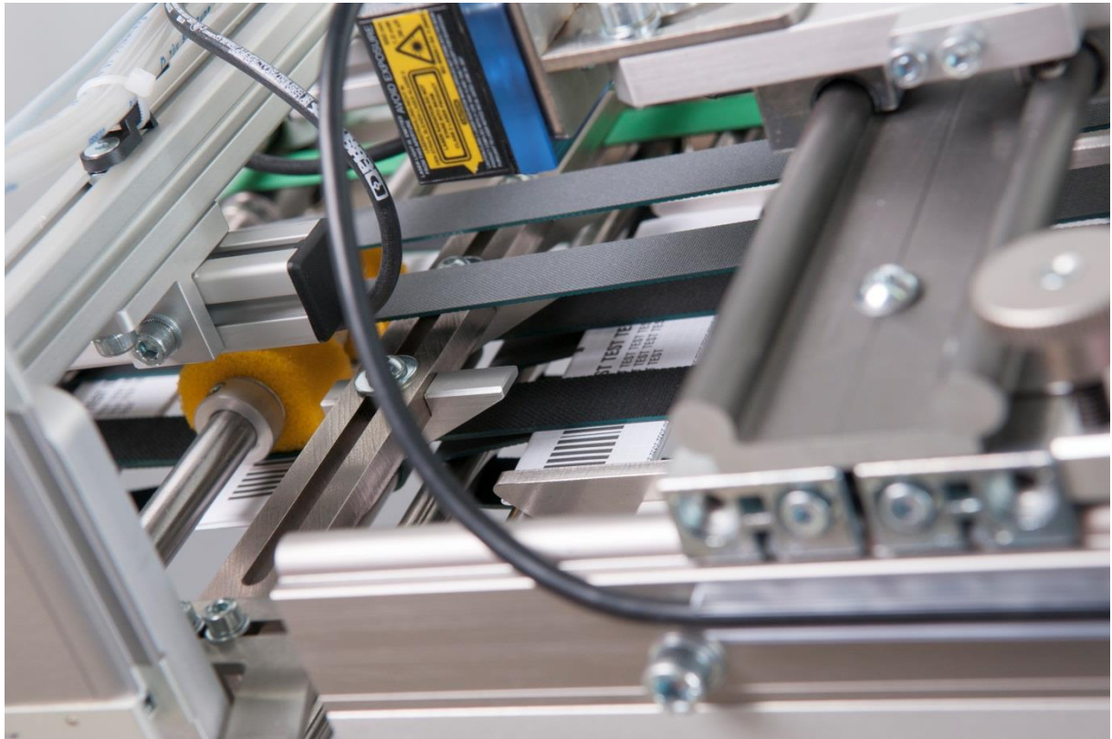
pneumatic rejection unit